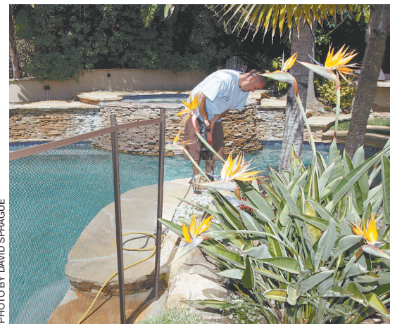
Pools: Guardian employee builds safety fence.